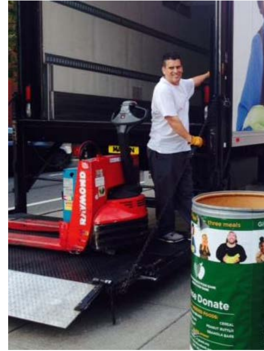
Food goes to partners and food pantries