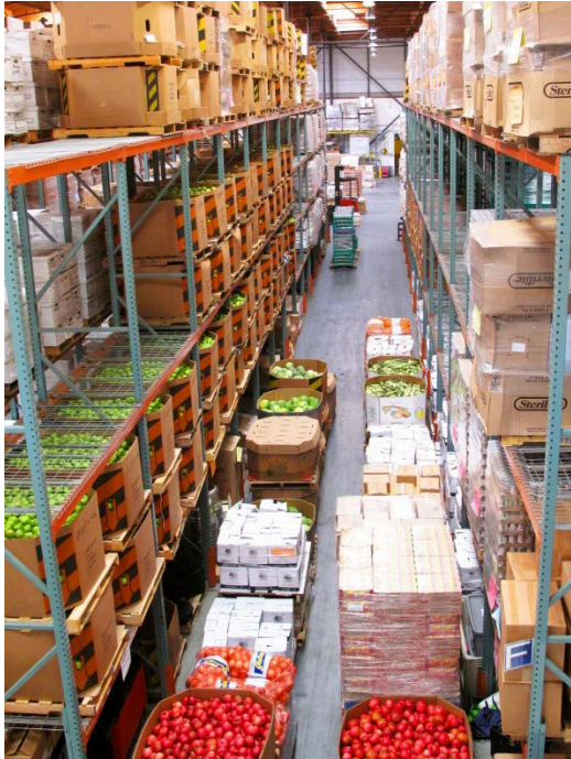
We collect millions of pounds of food