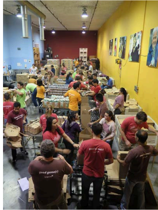
Volunteers pack the food at the warehouse